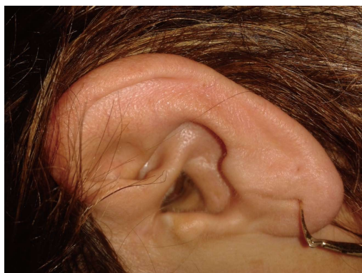
Figure 2 Post-operative result.

the respective author's hands. These techniques rely on creating a meatoplasty using a fibrocartilaginous posterior meatal flap in a post-auricular approach mastoidectomy, or partially resecting conchal bowl cartilage for the endaural approach [3] . Traditional thinking with regards to meatoplasty surgery has tended to focus on creating a large meatoplasty thought to support optimal ventilation, reduce both bacterial and debris accumulation [4-7] . However, the "big is better" approach is often associated with a few complications which include poor cosmesis and poor hearing aid fitting amongst other things [8,9] .