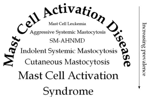
Figure 1 Spectrum of mast cell disease. SM-AHNMD: Systemic mastocytosis with associated clonal hematologic non-mast-cell-lineage disorder.

In recognition of the fact that all MC disease is, first and foremost, disease of inappropriate MC activation, Akin et al. [23] have proposed a new umbrella term of MC