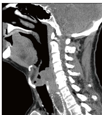
Figure 2 Computed tomography-scan: Complete obstruction of the esophagus.